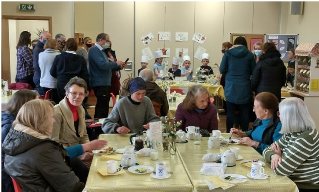
Gathering together - March 2022