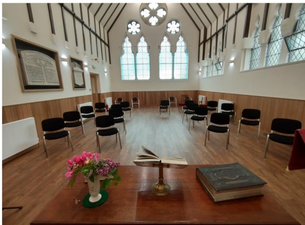
Socially Distanced - June 2021